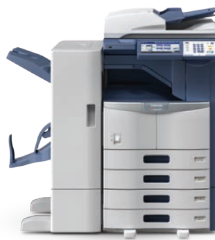
e-STUDIO306 with Saddle-Stitch Finisher.