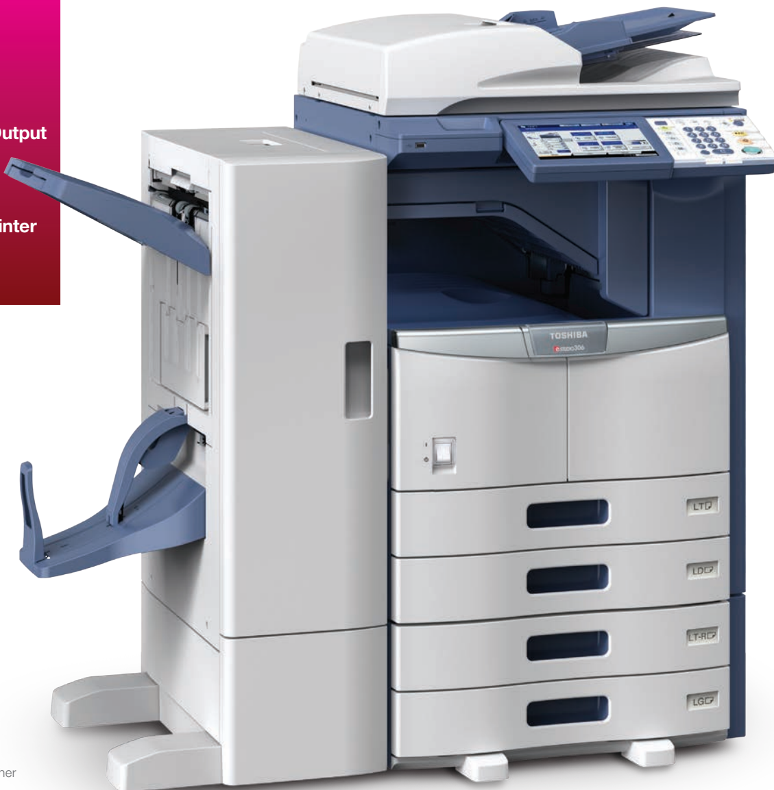
e-STUDIO306 with Saddle-Stitch Finisher