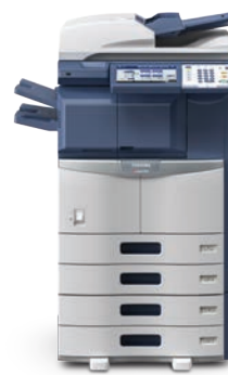
e-STUDIO306 with 50-Sheet Inner Finisher and Hole Punch.