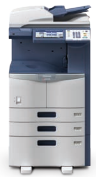
e-STUDIO306 with 2,000-Sheet LCF.