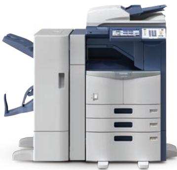
e-STUDIO306 with 2,000-Sheet LCF, Hole Punch, and Saddle-Stitch Finisher.